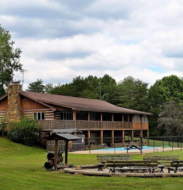
View of the Hilltop Lodge